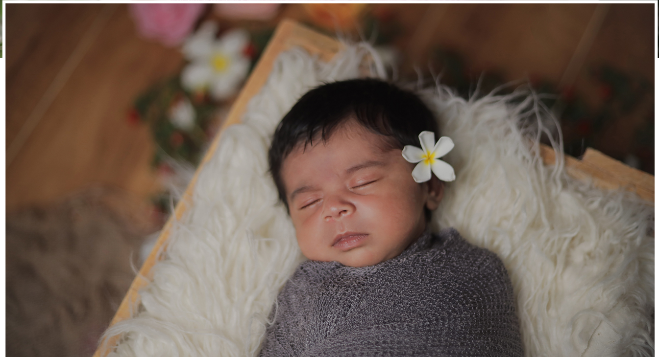
“Heaving a baby is like heaving a bit of heaven right here on earth.”